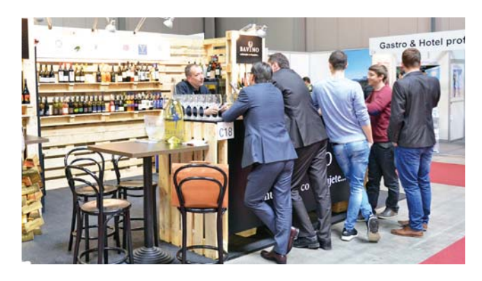
Partners of the fair: